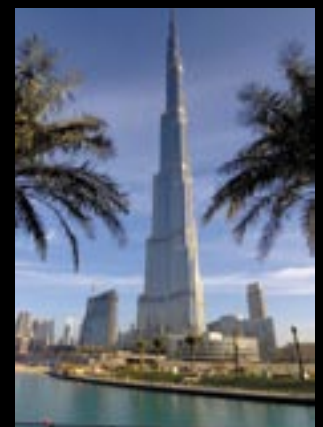
Burj Khalifa Tower (Dubai): More than 40,000 tonnes of steel

GFMS also plans to introduce similar services on the HR plate , CR and galvanized product markets.